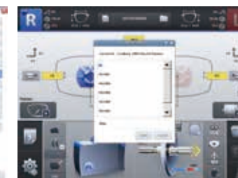
Direct DCS(OMA) Import