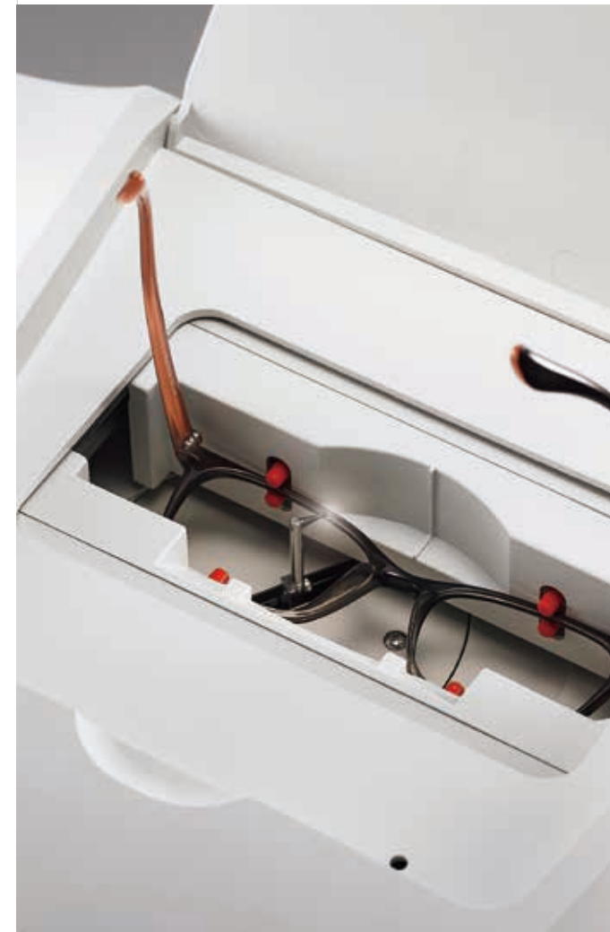
Built-in Tracer in method of Auto / Semi-Auto Mode

The new Exelon is designed to help users achieve satisfactory results with minimum time and effort.