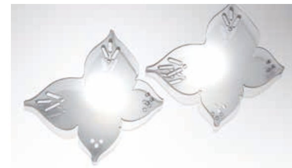
Scan & Cut Process