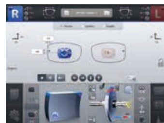
Chemistrie Clip Editing