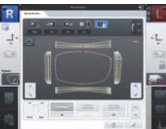
Auto / Manual 3D Simulation

Fitting quality is even better than previous models by applying Intelligent Algorithms such as Automatic correction of lens size, bevel or grooving, and PD correction