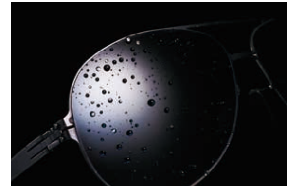
Hydrophobic Lens Fitting

Touch method which can be easily started even if machine operation is not familiar