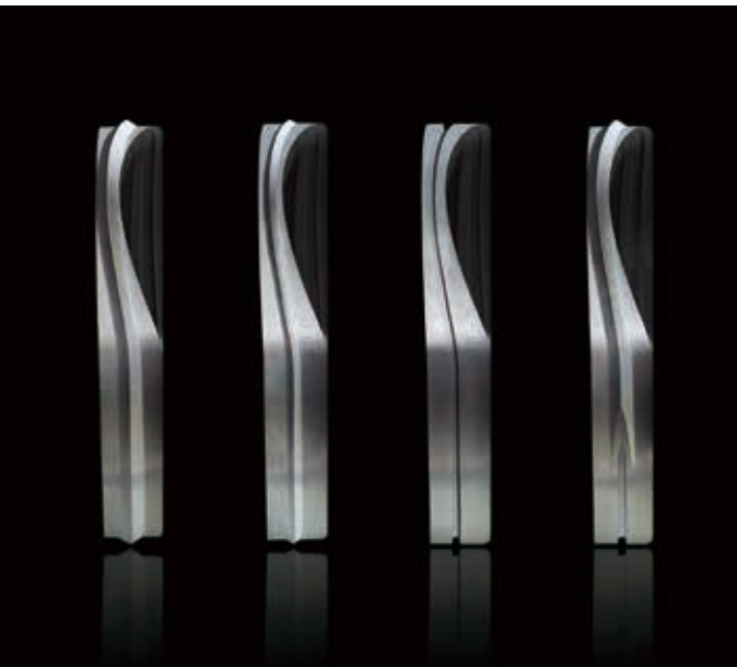
Edging Type / Bevel, Mini Bevel, Grooving, Hybrid Grooving

This new generation of Excelon is very user friendly. It has a wide variety of modes to suit all User requirements. A higher level of efficiency and functionality can also be possible by integrating the optional auto blocker and/or driller.