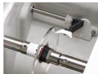
3 Different Feeling Positions