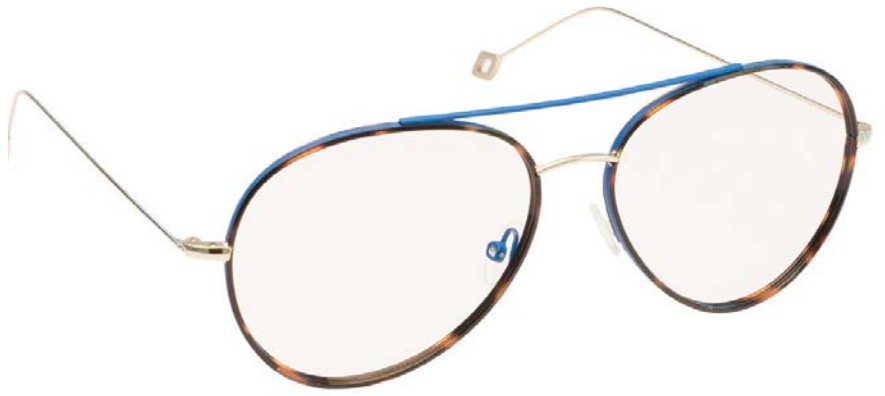
57-16 c. 0023