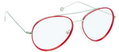
57-16 c. 0100