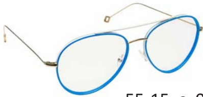
55-15 c. 0006