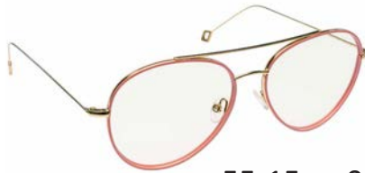
55-15 c. 0013